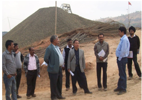
Director AYUSH, Director NEIFM, Pasighat, Director NEIAH reviewing the construction of NEIAH (16.3.12)