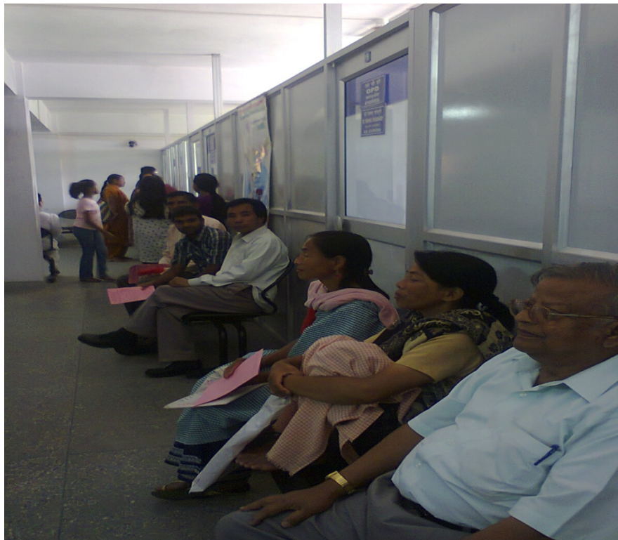
OPD City Centre, NEIAH at Nongrim Hills, Shillong