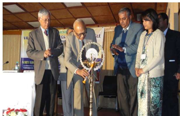
Inauguration of the National Seminar