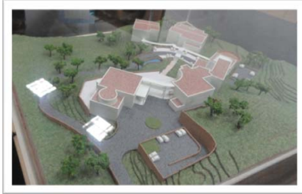
Angular view of the Model of Phase I NEIAH, Shillong