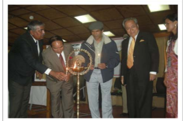
Lighting of lamp in 1st Foundation Day Celebration