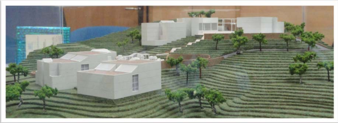
Panaromic view of NEIAH, Shillong Phase - I