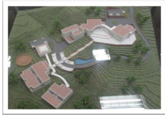
Angular view of the Model of Phase I NEIAH, Shillong