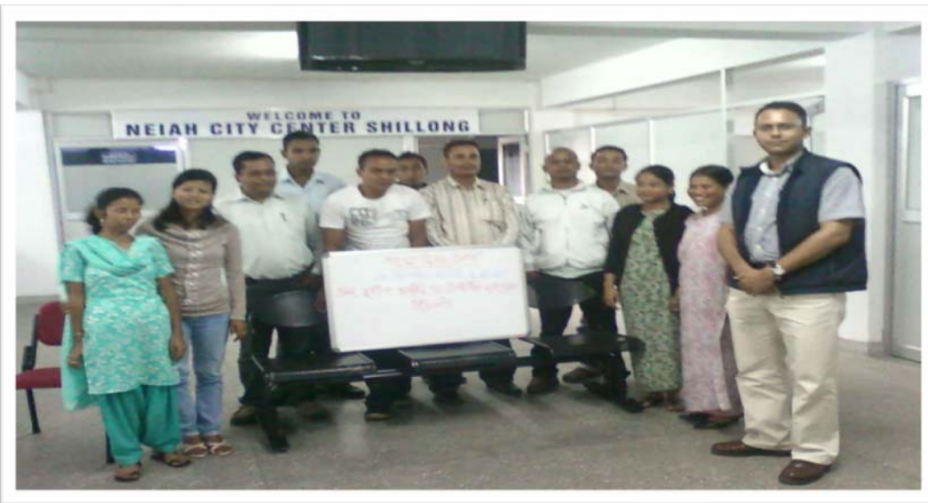
Hindi day celebration' 2012