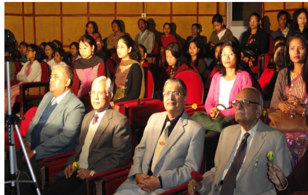
Guest & Participants of National Seminar