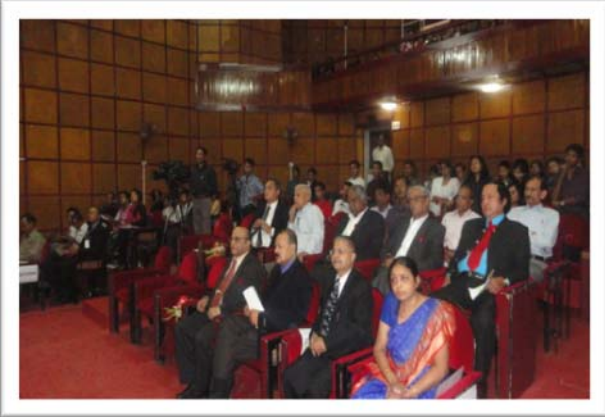
Guest of 1st Foundation Day Celebration